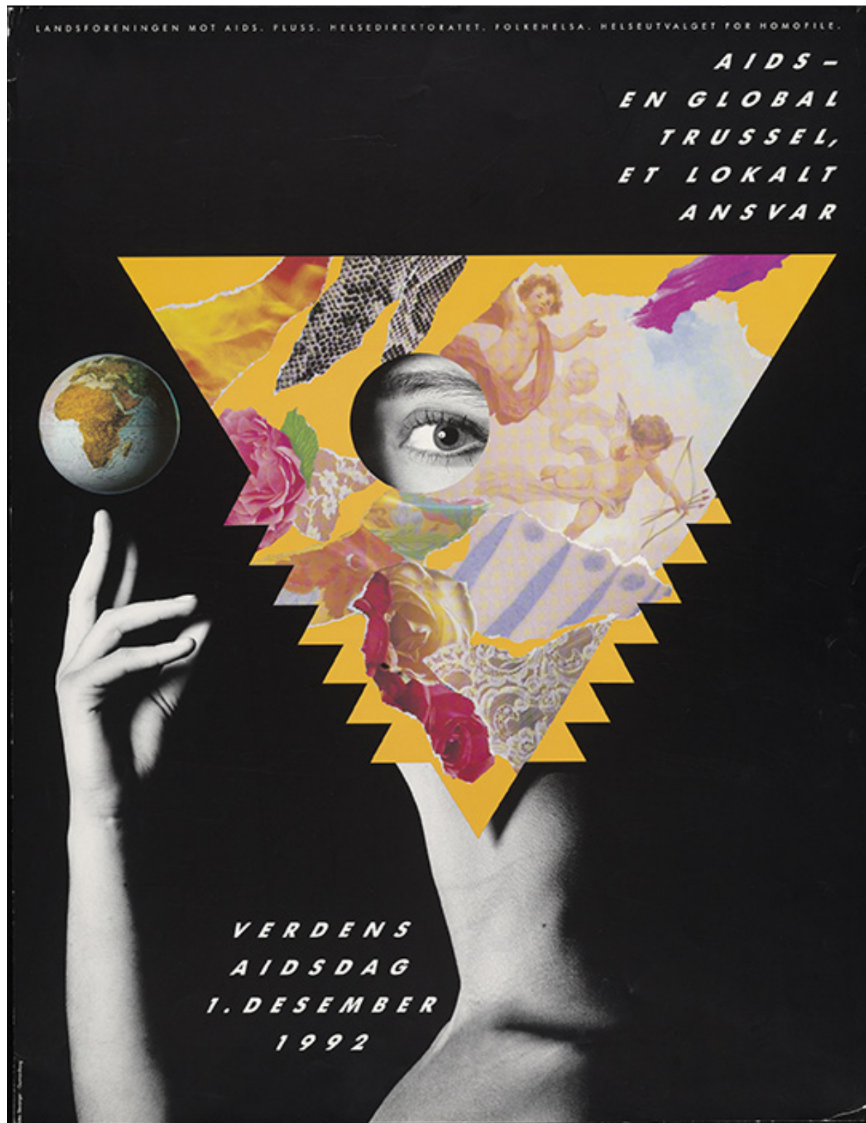
1. Landsforeningen Mot AIDS, AIDS: A Global Threat, A Local Answer , 1992, 65" x 50" x 25 9/16", Image courtesy of the Department of Rare Books, Special Collections, and Preservation, River Campus Libraries, University of Rochester.