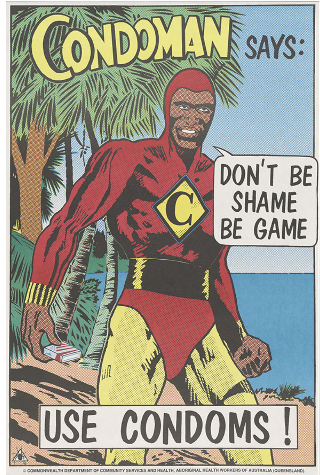
11. Australia Department of Community Services and Health, Condoman Says: Don't Be Shame, Be Game. Protect Yourself , 1991, 42" x 28" x 16 9/16", Image courtesy of the Department of Rare Books, Special Collections, and Preservation, River Campus Libraries, University of Rochester.