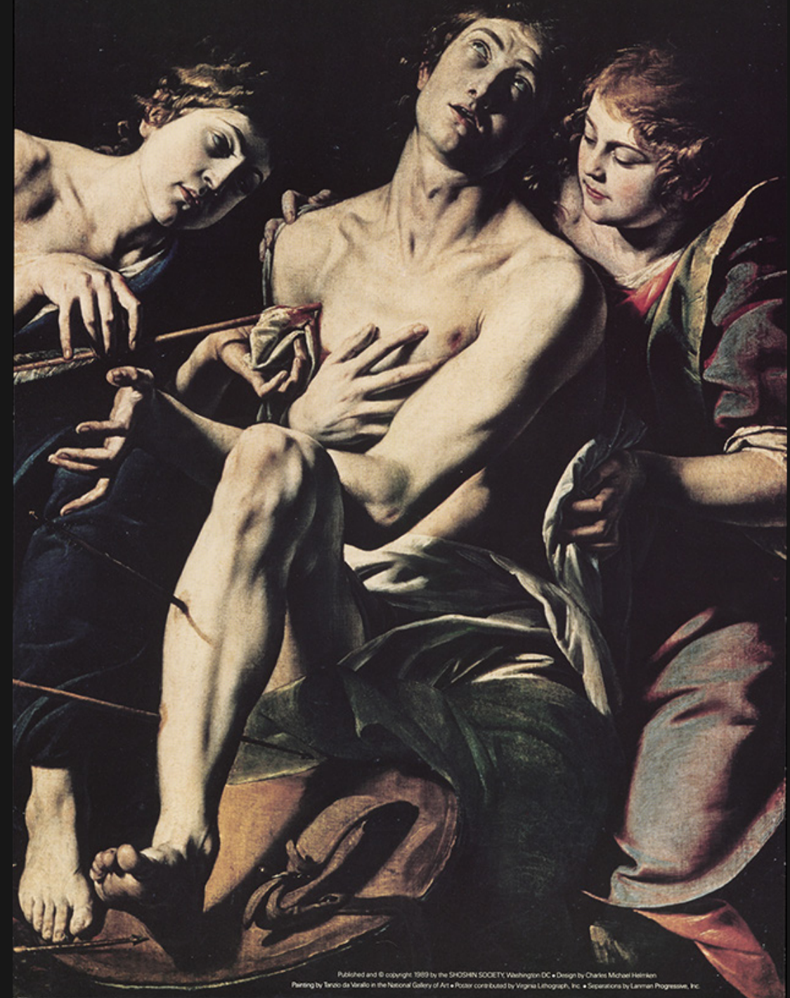
9. Shoshin Society/Painting: Tanzio da Varallo, Love AIDS People , 1988, 62" x 42" x 24 7/16".