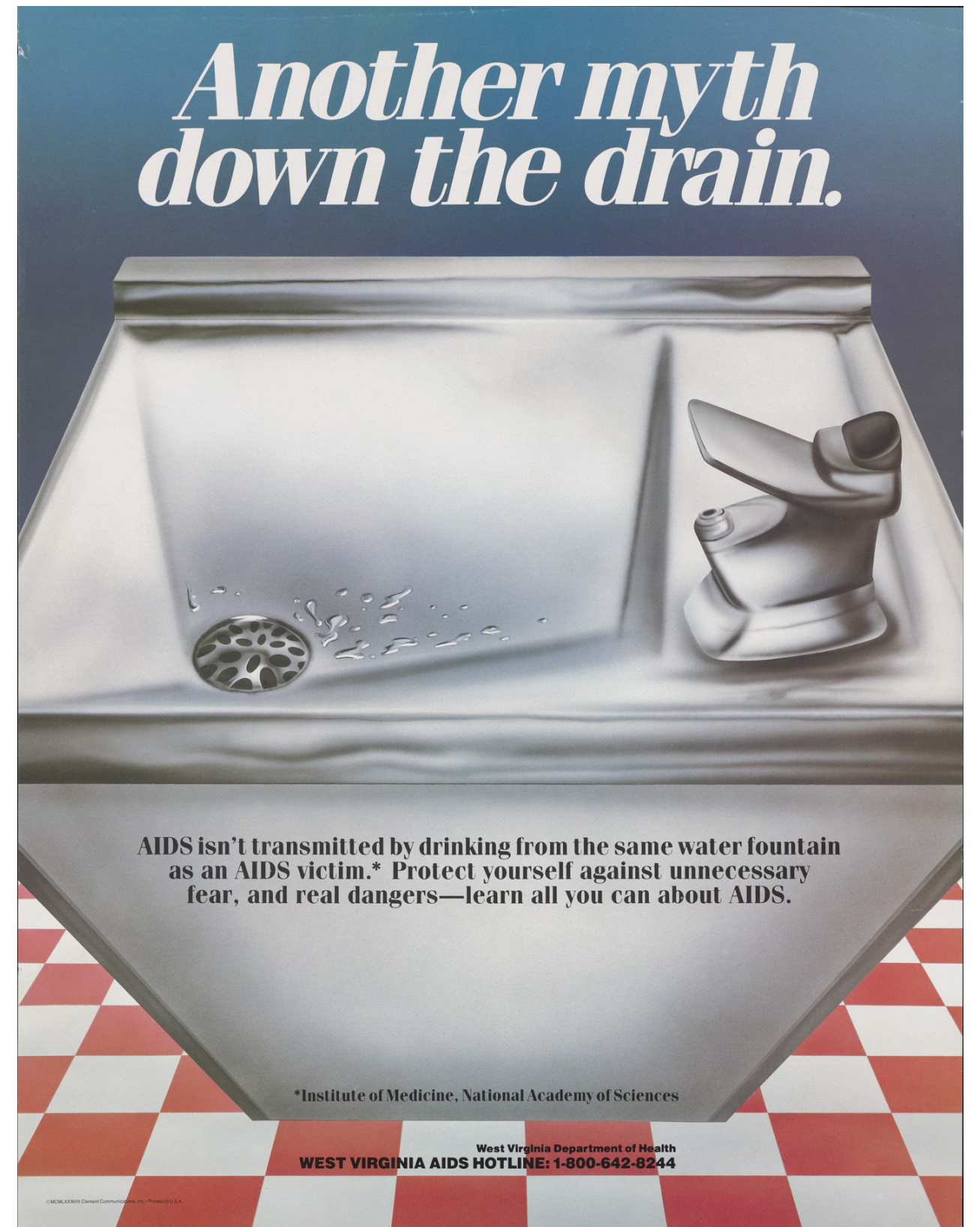
5. West Virginia State Department of Health, Another Myth Down the Drain , 1988, Medium, 56" x 43" x 22", Image Courtesy of the Department of Rare Books, Special Collections, and Preservation, River Campus Libraries, University of Rochester.