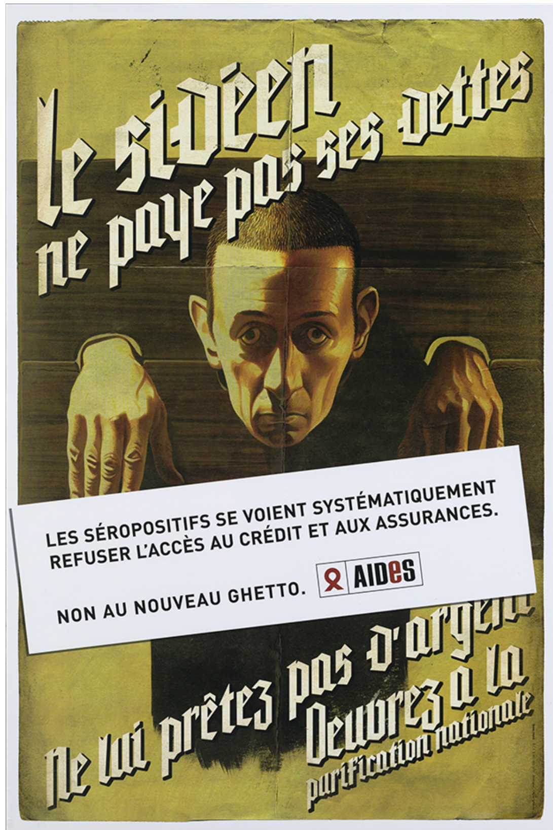
4. AIDeS, An AIDS Patient Doesn't Pay His Debts (translated from French) from the No to the New Ghetto Series , no date, 60" x 40" 23 10/16", Image courtesy of the Department of Rare Books, Special Collections, and Preservation, River Campus Libraries, University of Rochester.