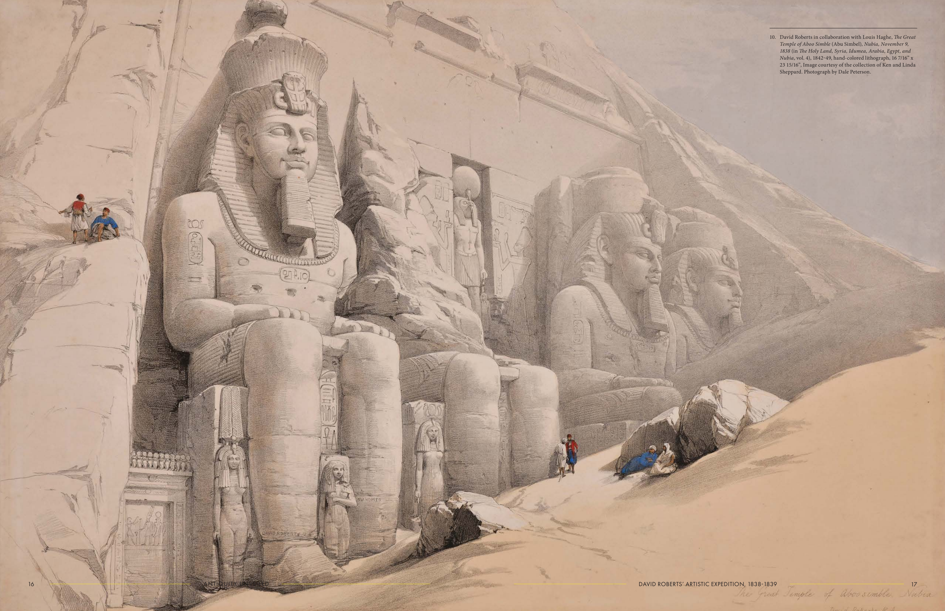
10. David Roberts in collaboration with Louis Haghe, The Great Temple of Abou Simble (Abu Simbel), Nubia, November 9, 1838 (in The Holy Land, Syria, Idumea, Arabia, Egypt, and Nubia , vol. 4), 1842-49, hand-colored lithograph, 16 7/16" x 23 15/16", Image courtesy of the collection of Ken and Linda Sheppard. Photograph by Dale Peterson.