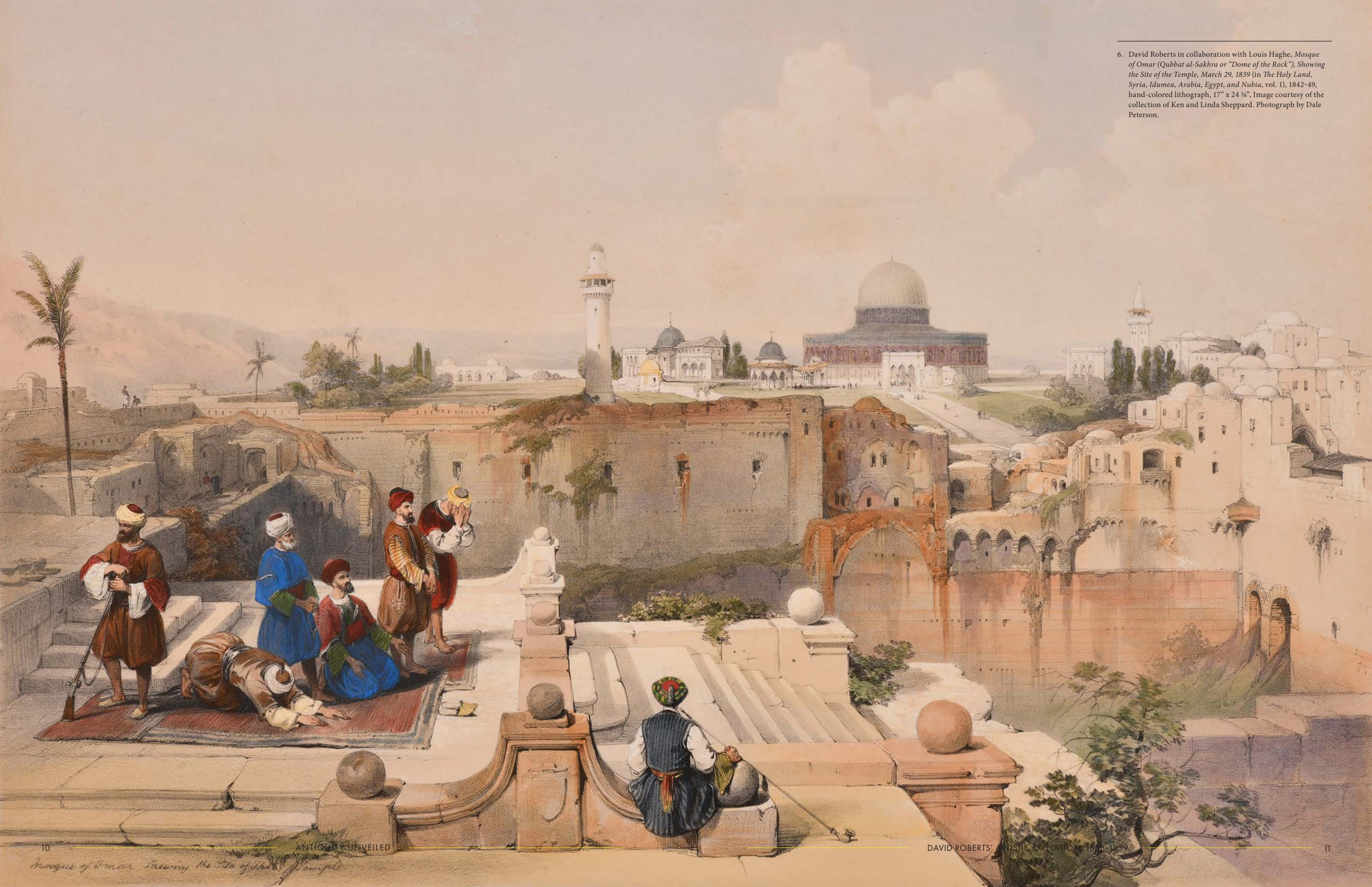
6. David Roberts in collaboration with Louis Haghe, Mosque of Omar (Qubbat al-Sakhra or "Dome of the Rock"), Showing the Site of the Temple, March 29, 1839 (in The Holy Land, Syria, Idumea, Arabia, Egypt, and Nubia , vol. 1), 1842-49, hand-colored lithograph, 17" x 24 1/8"