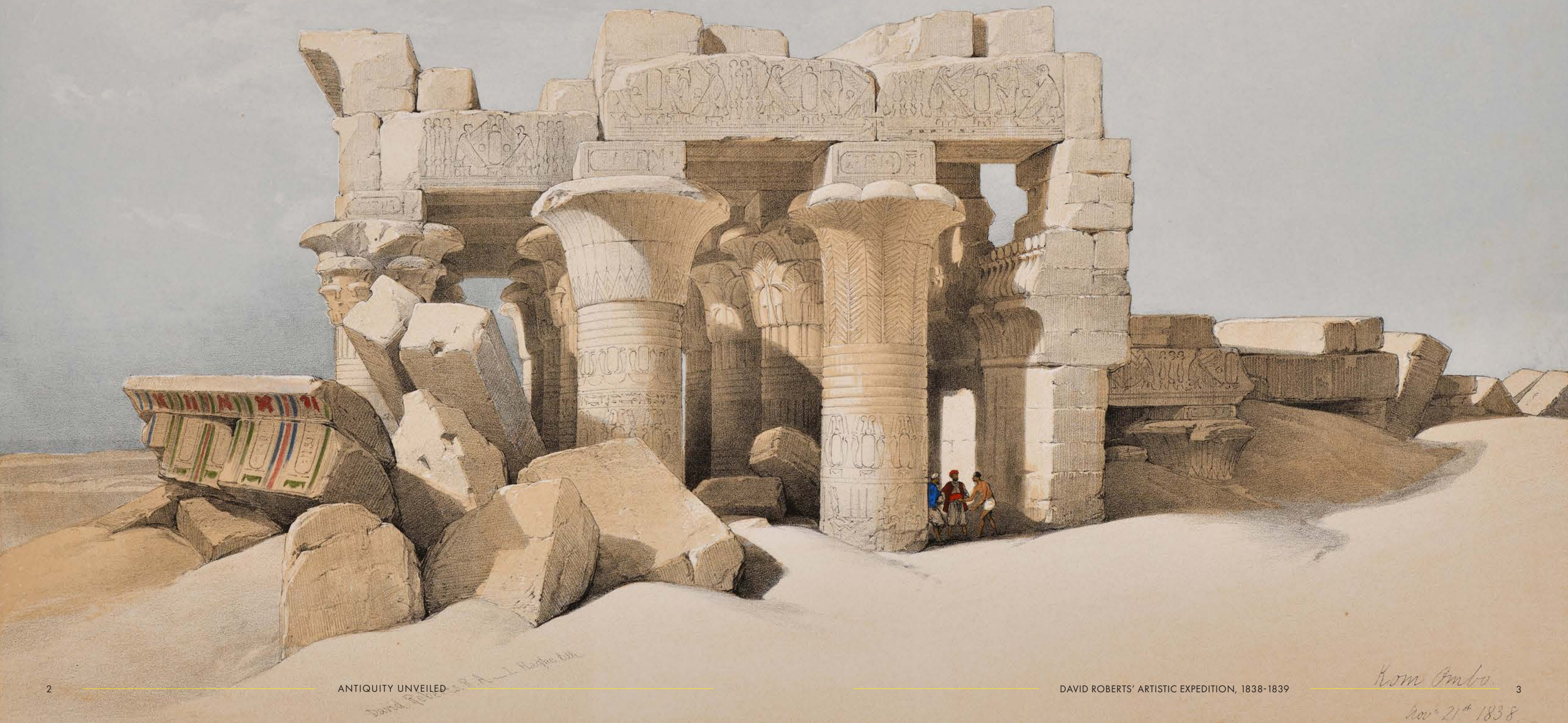
1. David Roberts in collaboration with Louis Haghe, Kom Ombo November 20–21, 1838 ( in The Holy Land, Syria, Idumea, Arabia, Egypt, and Nubia , vol. 5), 1842–49, hand-colored lithograph, 16 3/8" x 23 15/16", Image courtesy of the collection of Ken and Linda Sheppard. Photograph by Dale Peterson.