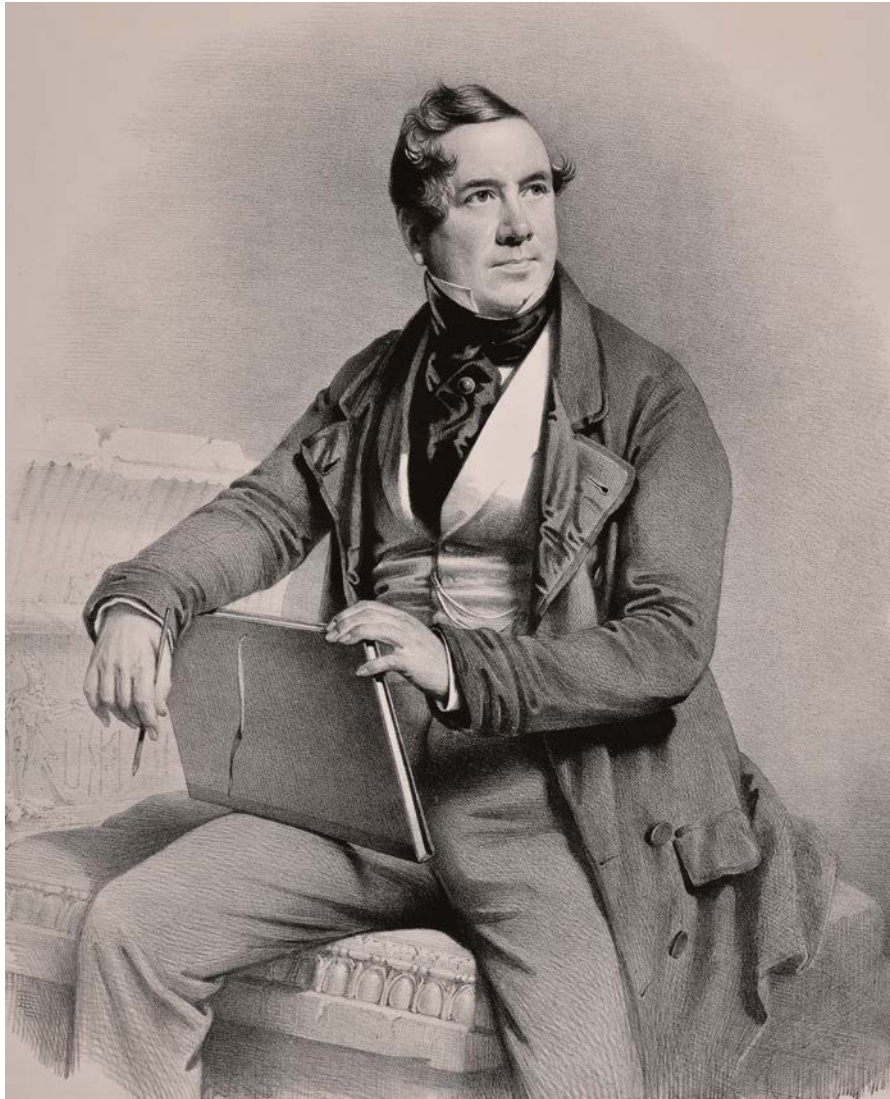
FRONT Detail David Roberts in collaboration with Louis Haghe, Thebes (the Colossi of Memnon seen from the southwest) , December 4, 1838 (in The Holy Land, Syria, Idumea, Arabia, Egypt, and Nubia , vol. 4), 1842-49, hand-colored lithograph, 16 9/16" x 23 15/16", Image courtesy of the collection of Ken and Linda Sheppard. Photograph by Dale Peterson. BACK Charles-Louis Bagniet, Portrait of David Roberts , 1844 (in The Holy Land, Syria, Idumea, Arabia, Egypt, and Nubia , vol. 1), 1842-49, lithograph, 24 1/8 x 16", Image courtesy of the collection of Ken and Linda Sheppard. Photograph by Dale Peterson.