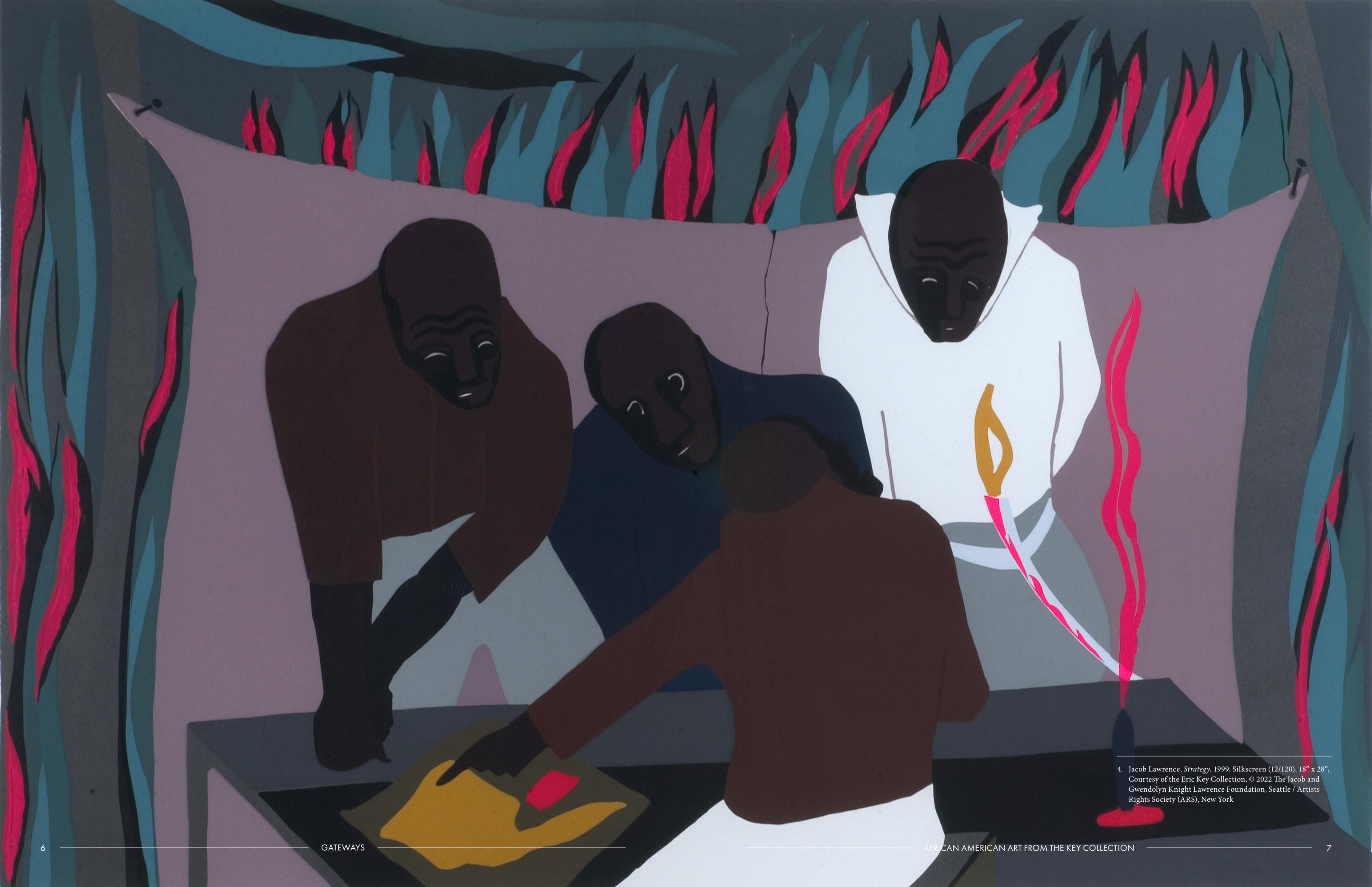
4. Jacob Lawrence, Strategy , 1999, Silkscreen (12/120), 18" x 28", Courtesy of the Eric Key Collection, © 2022 The Jacob and Gwendolyn Knight Lawrence Foundation, Seattle / Artists Rights Society (ARS), New York