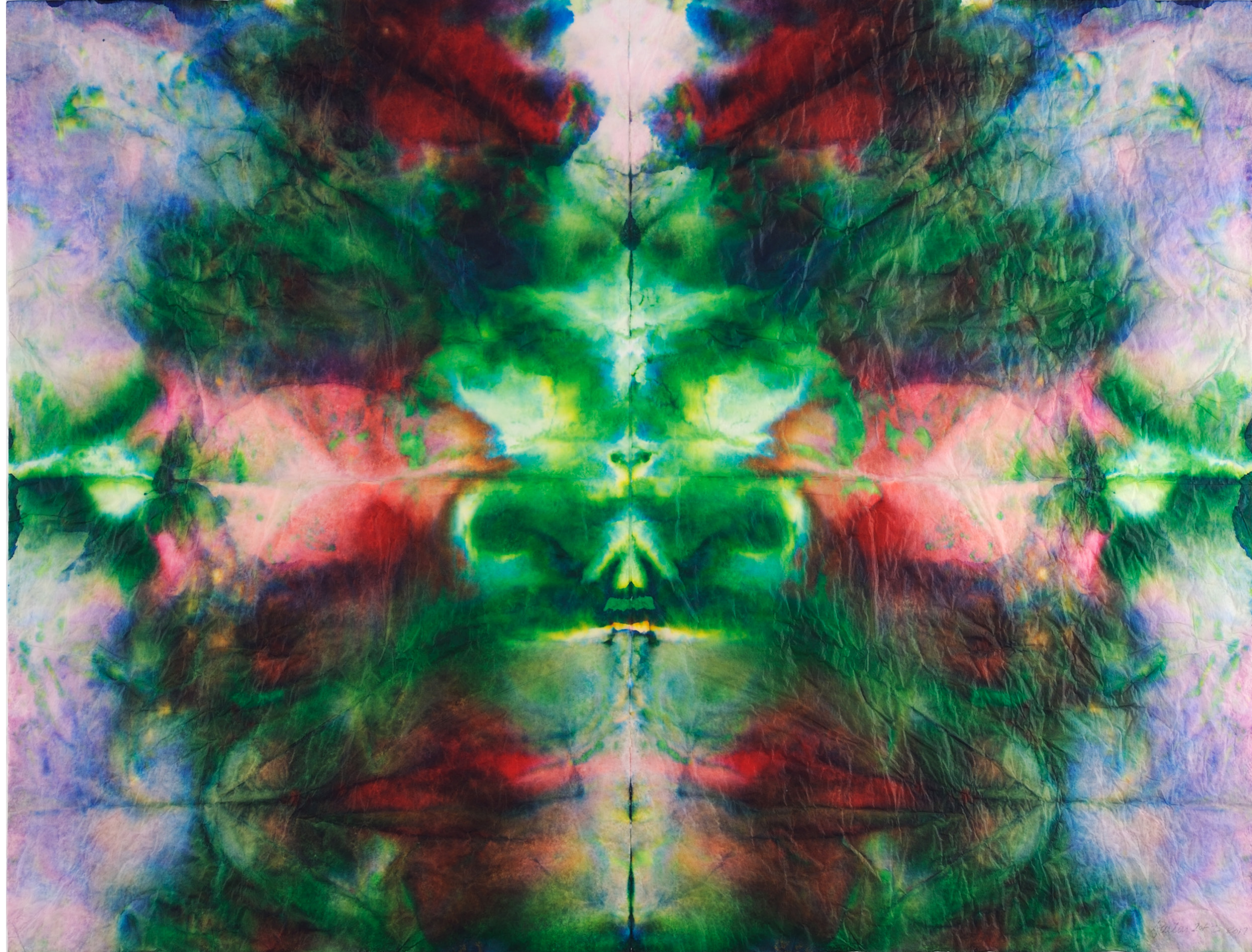
9. Maya Freelon, Balance , 2017, Watercolor, 30" x 40", Courtesy of the Eric Key Collection, © Maya Freelon.

International Arts & Artists is extremely pleased to bring this exhibition, with its rich insights into African American art, to our partners. Gateways will tour for four years—until late 2027—and is now open for bookings.