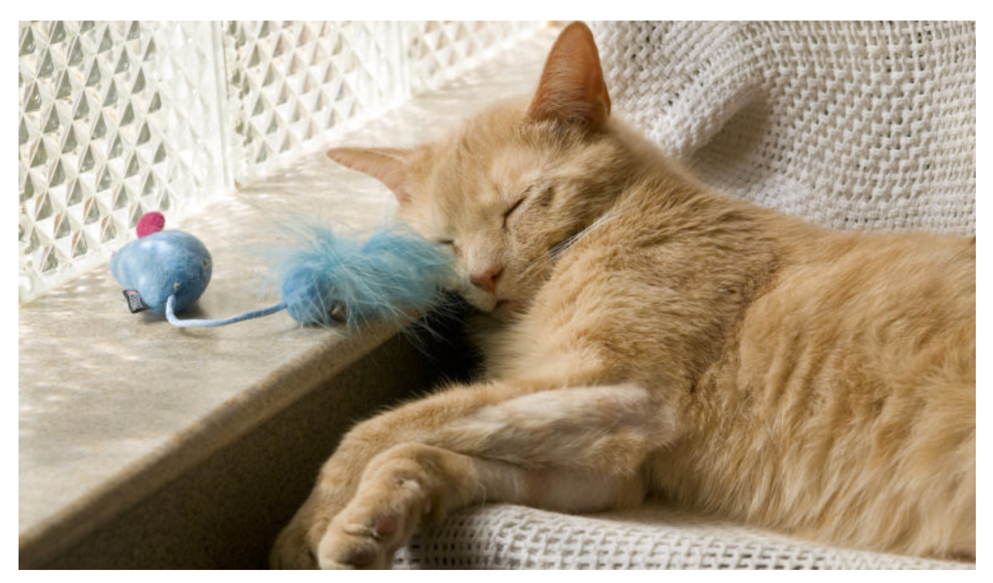
The Humane Rescue Alliance and Meow DC will host a day of feline-themed activities on Saturday, including a trivia contest and photo class.