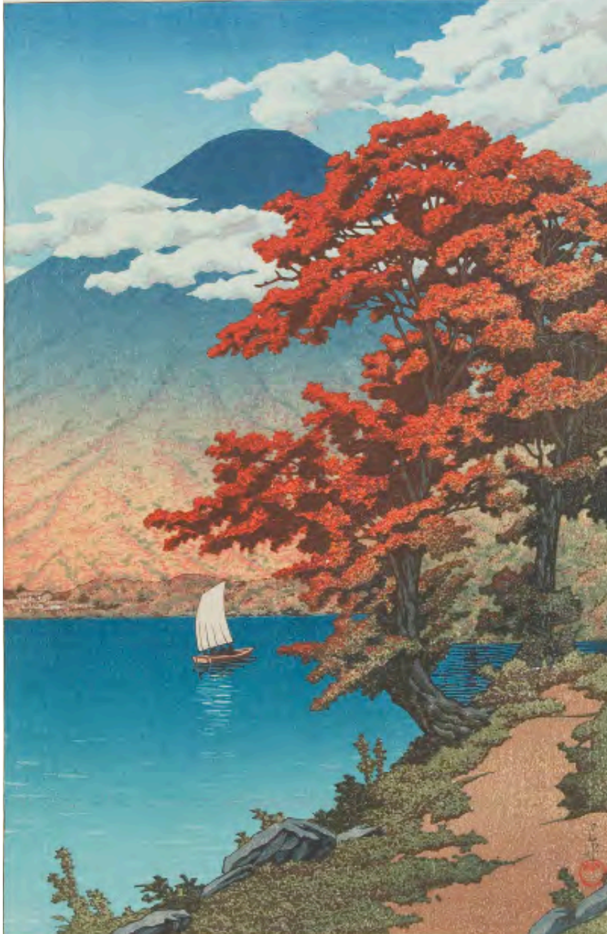
4. Kawase Hasui, Lake Chūzenji at Nikkō , 1930, woodblock print, ink and color on paper. Minneapolis Institute of Art, Gift of Paul Schweitzer, P.77.28.17.