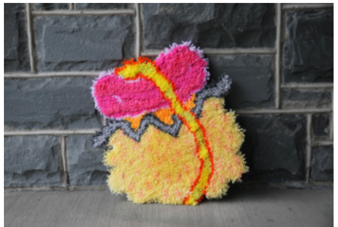
"Pillow Pile" by Danni O'Brien (2018)

Sethi's other body of work involves tiles. Along a wall of the gallery are several small paintings done in gouache, a water-based medium, on acrylic tiles. The paintings, themselves, are of tile designs derived from the floors of the San Marco Basilica in Venice, Italy, the Library of Congress, and the walls of the Ishtar Gate—formerly in Babylon, now in Berlin. Each acrylic painting—some from this exhibition, and some from previous exhibitions—has been situated horizontally beneath a block of ice left to melt over the course of the day. As the ice melts, it dampens the gouache on the surface, causing it to lift, flake, smear, or dissolve, slowly distorting the image. Permanence is, once again, in question.