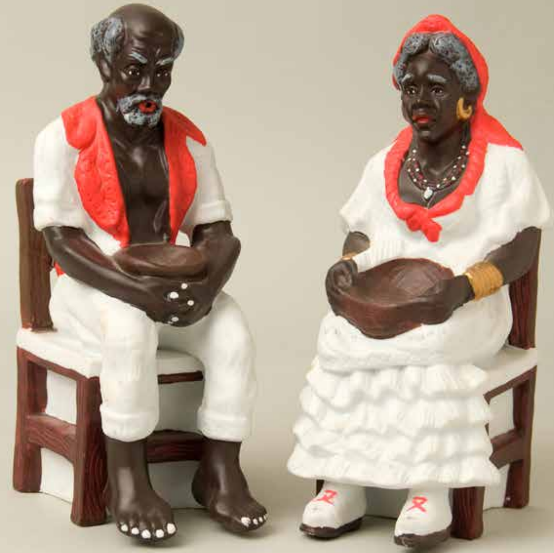
12. Statues of male and female African spirits , porcelain.

Often heard in discussions of Afro-Atlantic religions is the dictum that “hierarchy is everything.” Priesthoods tend to be organized according to seniority, and, like the Abrahamic faiths, these religions often configure divinity in terms of royalty. At the same time, many gods and spirits of the Afro-Atlantic religions are regarded as the spirits of dead slaves or as spirits enslaved by the priest. These slave spirits are seen as not only highly efficacious but also capable of astute bargaining and, when their masters break a promise, fatal vengeance. Indeed, when they manifest themselves in contemporary religious ceremonies, they are often dominant over the spirits of their masters.