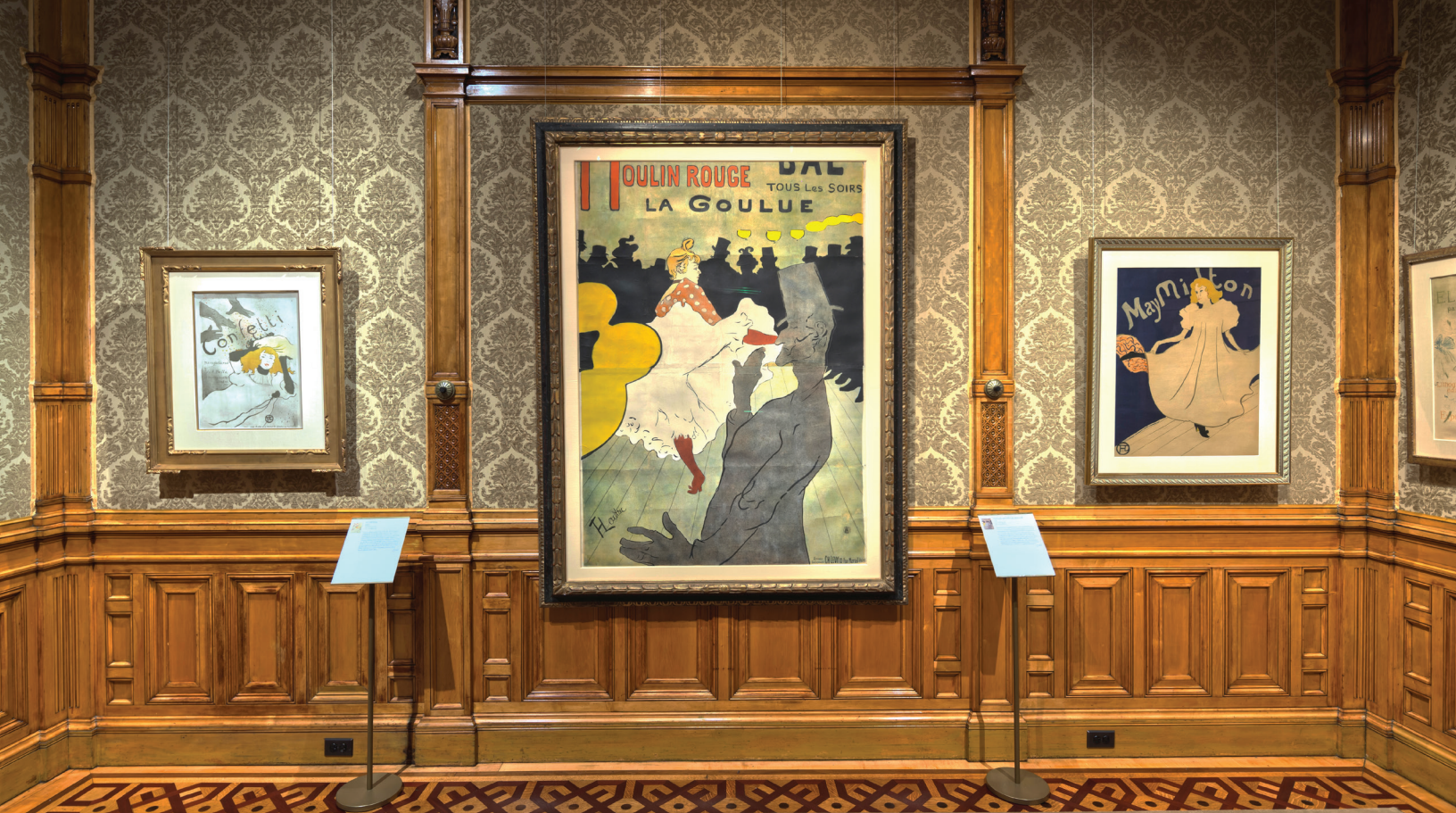
Installation of L’Affichomania: The Passion for French Posters at the Richard H. Driehaus Museum