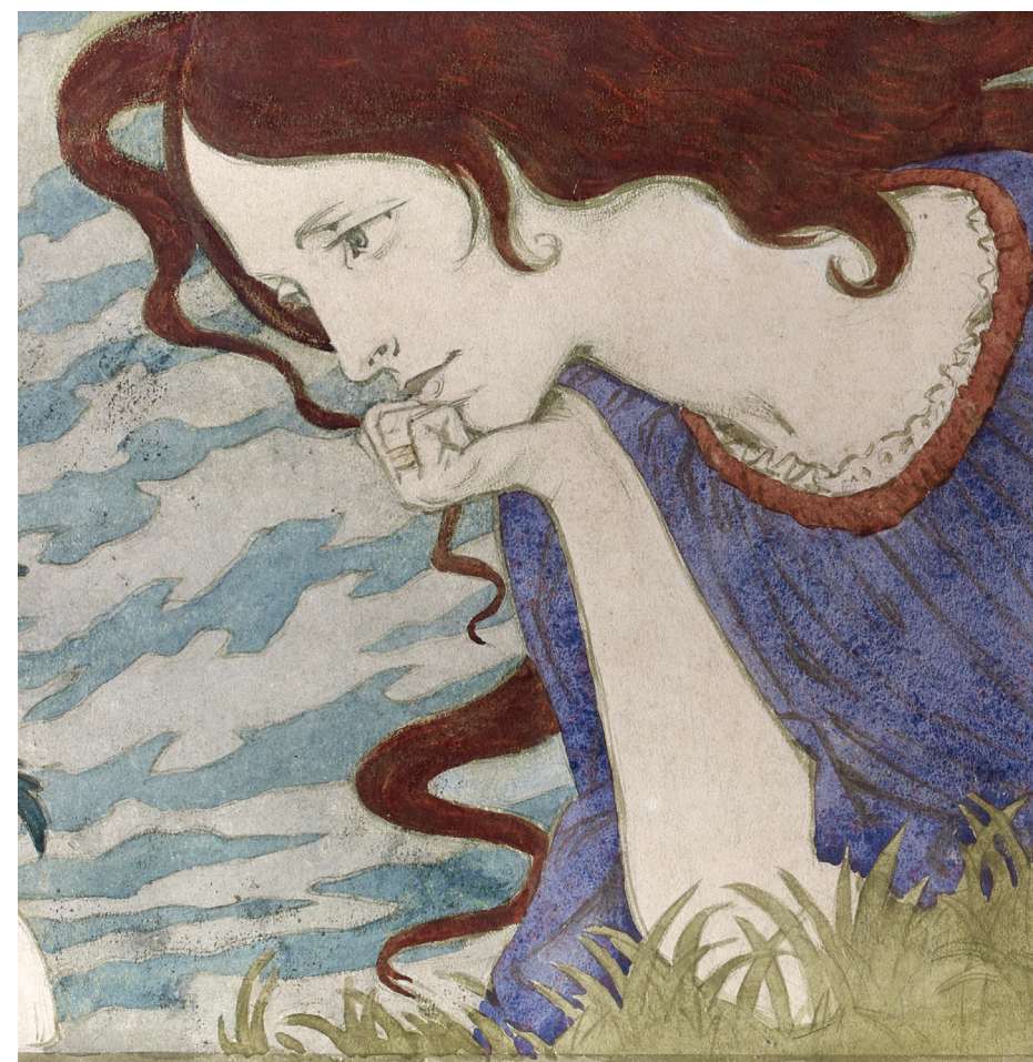
Eugène Grasset, Anxiété , 1897, watercolor, photograph by John Faier, © 2015, courtesy of the Richard H. Driehaus Museum

Formerly Curator of American Decorative Arts and Sculpture at the Museum of Fine Arts, Boston, she has created exhibitions and produced catalogues for many institutions. Recent exhibitions include Crafting Modernism: Midcentury American Art and Design (Museum of Arts and Design, 2011–12), Gilded New York: Design, Fashion & Society (Museum of the City of New York, 2013–17), New York Silver, Then & Now (Museum of the City of New York, 2017–18), and L’Affichomania: The Passion for French Posters (The Richard H. Driehaus Museum, Chicago, 2017–18).