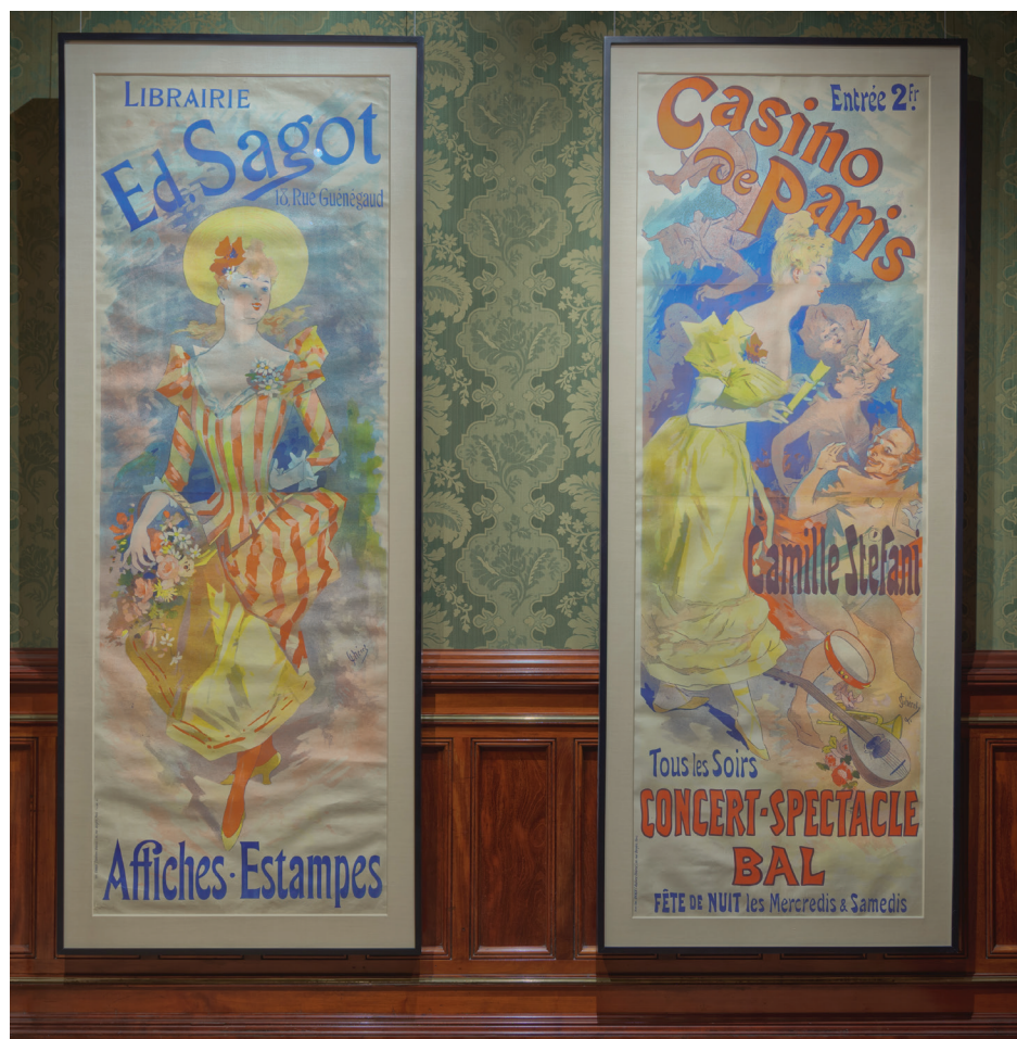
Installation of L’Affichomania: The Passion for French Posters at the Richard H. Driehaus Museum

In 2003, the Richard H. Driehaus Museum was founded in Chicago to preserve and publicly exhibit American and European fine and decorative arts of the Gilded Age (1870–1900). Today the Museum is a stunning showcase for late nineteenth- and early twentieth-century art and design, displayed against the magnificent backdrop of the historic Samuel M. Nickerson Mansion (1879–83), which opened to the public in 2008 after an extensive five-year restoration. The Museum is a premier example of historic preservation, offering visitors an opportunity to experience through its architecture, interiors, collection, and exhibitions how the prevailing design philosophies of the period were interpreted by artists, architects, and designers at the waning of the nineteenth century and dawn of the twentieth century.