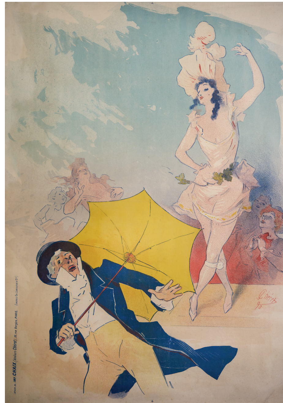
9 Jules Chéret, Folies-Bergère/Lo Loie Fuller Émilienne d'Alençon , 1893, color lithograph, photograph by John Faier, © The Richard H. Driehaus Museum, 2015 10 Jules Chéret, Théâtrophone , 1890, color lithograph, photograph by John Faier, © The Richard H. Driehaus Museum, 2015

Chéret remains the first master of the medium and a presiding figure in the field.