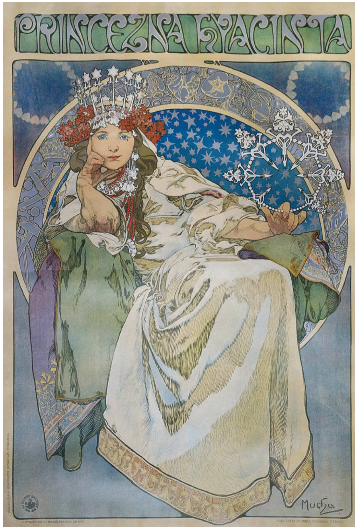
11 Eugène Grasset, Coquette , 1897, photograph by John Faier, © The Richard H. Driehaus Museum, 2015 12 Alphonse Mucha, Princess Hyacinth , 1911, color lithograph, photograph by John Faier, © The Richard H. Driehaus Museum, 2015

More than any other poster designer of the period, Mucha's work was iconic of the Art Nouveau style, with characteristic sinuous lines and subtle colors.