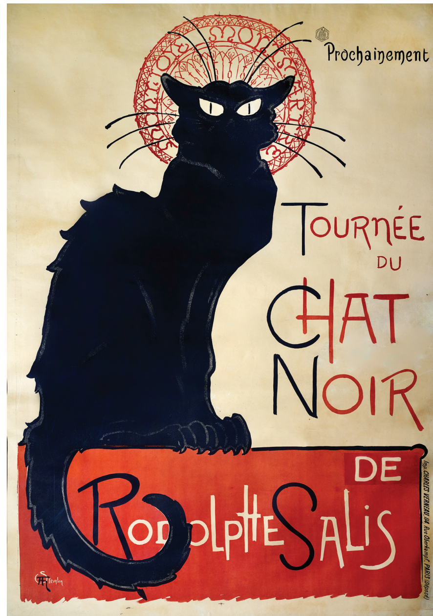
Théophile-Alexandre Steinlen, Le Chat Noir