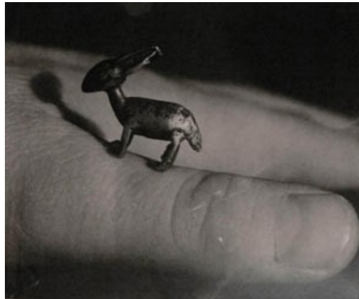
Man Ray, Untitled (Akan goldweight), c. 1933, Private Collection.

"But it is worth noting that a Jewish artist, Max Weber, was instrumental in bringing African art to the American avant-garde after his studies in Paris," she said, "just as an artist of Jewish origin (viz., Man Ray) was instrumental in introducing African art to a large audience through his photographs."