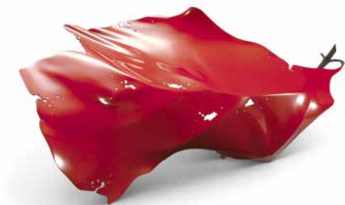
Muramoto Shingo, Wing of Foliage: Bending in the Wind , 2015, lacquer, bamboo, hemp cloth. 14 x 41 1/8 x 18 1/4 in. Minneapolis Institute of Art, The Curtis Dunnawan Fund for the Purchase of Asian Art, 2017.11.

As an art student, Murata had intended to learn woodworking in order to design furniture, but then he decided on lacquer instead. His approach at first was utilitarian but eventually shifted to the abstract. During his student days, he had considered how black luster lacquer might be used to suggest shadows, and he imagined how the lines of three-dimensional shapes would flow. Since 2006 he has translated these notions into freestanding works and wall pieces that he calls "silhouettes." The creatures Murata frequently encounters near his remote home in Nanto, Toyama Prefecture—snakes, feral cats, weasels, frogs—inspire him to create new objects. He uses maple wood as a substrate, or base. Although it is difficult to carve, he prefers maple because it is flexible and does not snap easily.