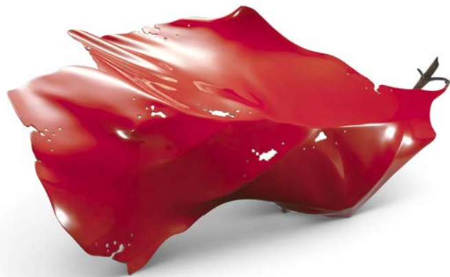
Muramoto Shingo, Wing of Foliage: Bending in the Wind , 2015, lacquer, bamboo, hemp cloth. 14 x 41 1/8 x 18 1/4 in. Minneapolis Institute of Art, The Curtis Dunnavan Fund for the Purchase of Asian Art, 2017.11.

Muramoto's technical mastery and exceptional lacquer artistry are widely recognized, and he has been commissioned to work on culturally significant buildings. For example, he helped restore a part of Tokyo's Zōjōji temple (1632), which is registered as an Important Cultural Property, and he restored the gold leaf at Akasaka Palace, now Japan's State Guest House, where visiting foreign dignitaries stay.