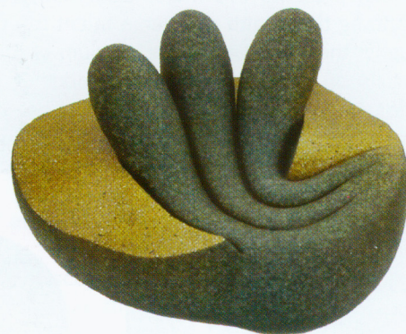
Ryu, Nam Hee

There is a strong sculptural emphasis to the show and individual pieces range in height from 10cm to 127cm. I was struck by how many of the artists had achieved very successful glaze affects, emulating rock surfaces and formations. This may partly be inspired by the fact that