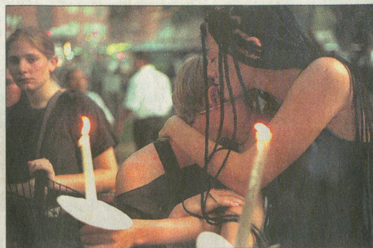
"Union Square Vigil" by Paul Fusco, Magnum Photos.