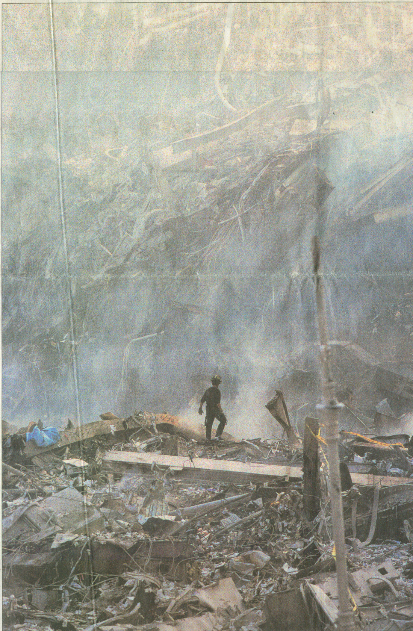
"Rescue Workers Search Mountains of Wreckage" by Steve McCurry, Magnum Photos.