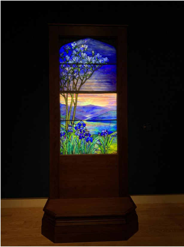
"Louis Comfort Tiffany: Treasures from the Driehaus Collection" opens to the public at the Cummer on Friday.