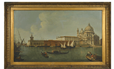
AGOPB MAJOR APRIL ESTATES AUCTION APR 21-21, 2018