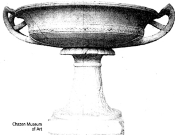
Chazen Museum of Art

... exhibit presents fragments of marble sculptures and other objects from seaside villas lost when Mt. Vesuvius erupted in 79 A.D.