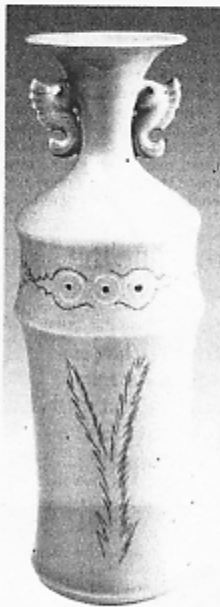
"Inlaid Celadon Bottle with Fish Shaped Handles" by Jong Koo Hwang is included in "From the Fire," on exhibit through Jan. 29 at the Honolulu Academy of Arts.

The exhibition comprises 108 pieces by 54 artists, with works reflecting ancient celadon, white ware and "punch'ong" traditions, while displaying a dynamic, contemporary aesthetic. Works are divided into three broad categories representing the modern move-