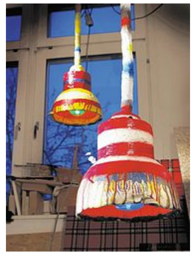
"Light Fittings," ceramic work by Pontus Lindvall

Swedish ceramic artists exhibit their work in Dubuque BY THE TELEGRAPH HERALD Friday, June 19, 2009