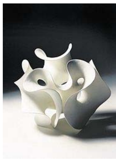
"Loop 1054," by Eva Hild