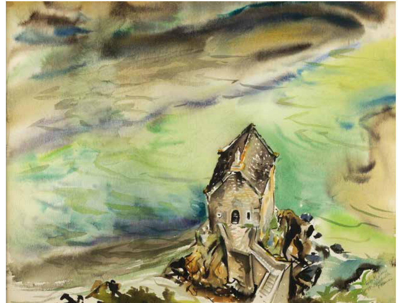
11. Sam Gilliam, Untitled, 1974, oil acrylic on rice paper.

His work is in the permanent collections of the Museum of Modern Art (New York, NY) and the Whitney Museum of American Art (New York, NY), the National Gallery of Art (Washington, DC), Baltimore Museum of Art (MD), Carnegie Institute (Pittsburgh, PA), Corcoran Gallery of Art (Washington, DC), Howard University Art Gallery (Washington, DC), Phillips Collection (Washington, DC), Art Institute (Chicago, IL), Walker Art Center (Minneapolis, MN), Boymans van Beuningen Museum (Rotterdam, the Netherlands), and the Tate Gallery (London), among others.