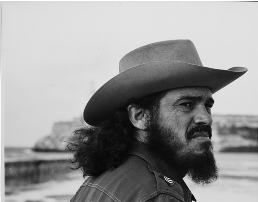
Revolutionary, Cuba, 1959