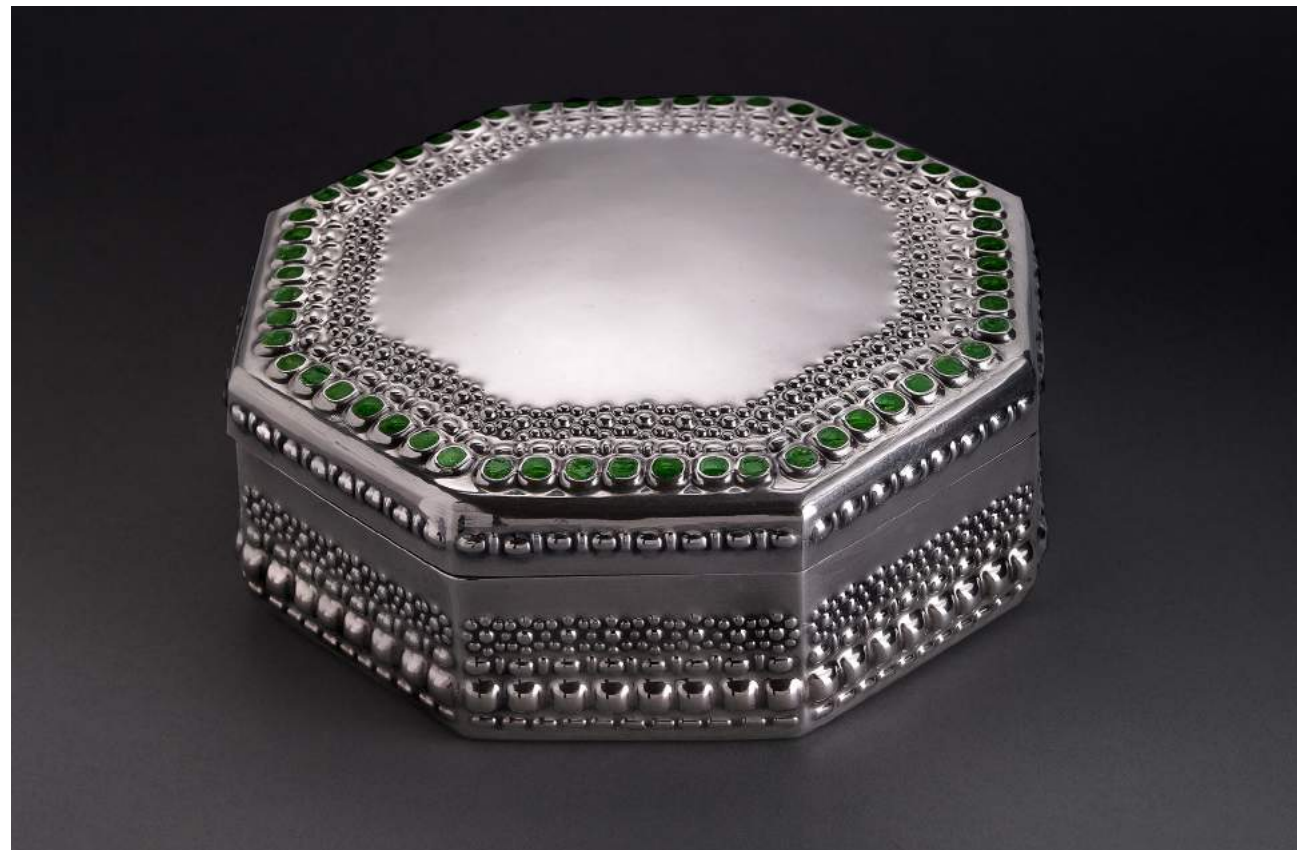
4 Tiffany Studios, Covered box, c. 1905

Tiffany's next major venture was as a prominent interior decorator for affluent New Yorkers. In 1881 he merged several design partnerships to create Louis C. Tiffany and Company, Associated Artists, which decorated the Veteran's Room of the Seventh Regiment Armory in New York that year, and the Red Room of the White House the following year. After the dissolution of this partnership in 1885, Tiffany established the Tiffany Glass Company, which was later renamed the Tiffany Glass & Decorating Company in 1892.