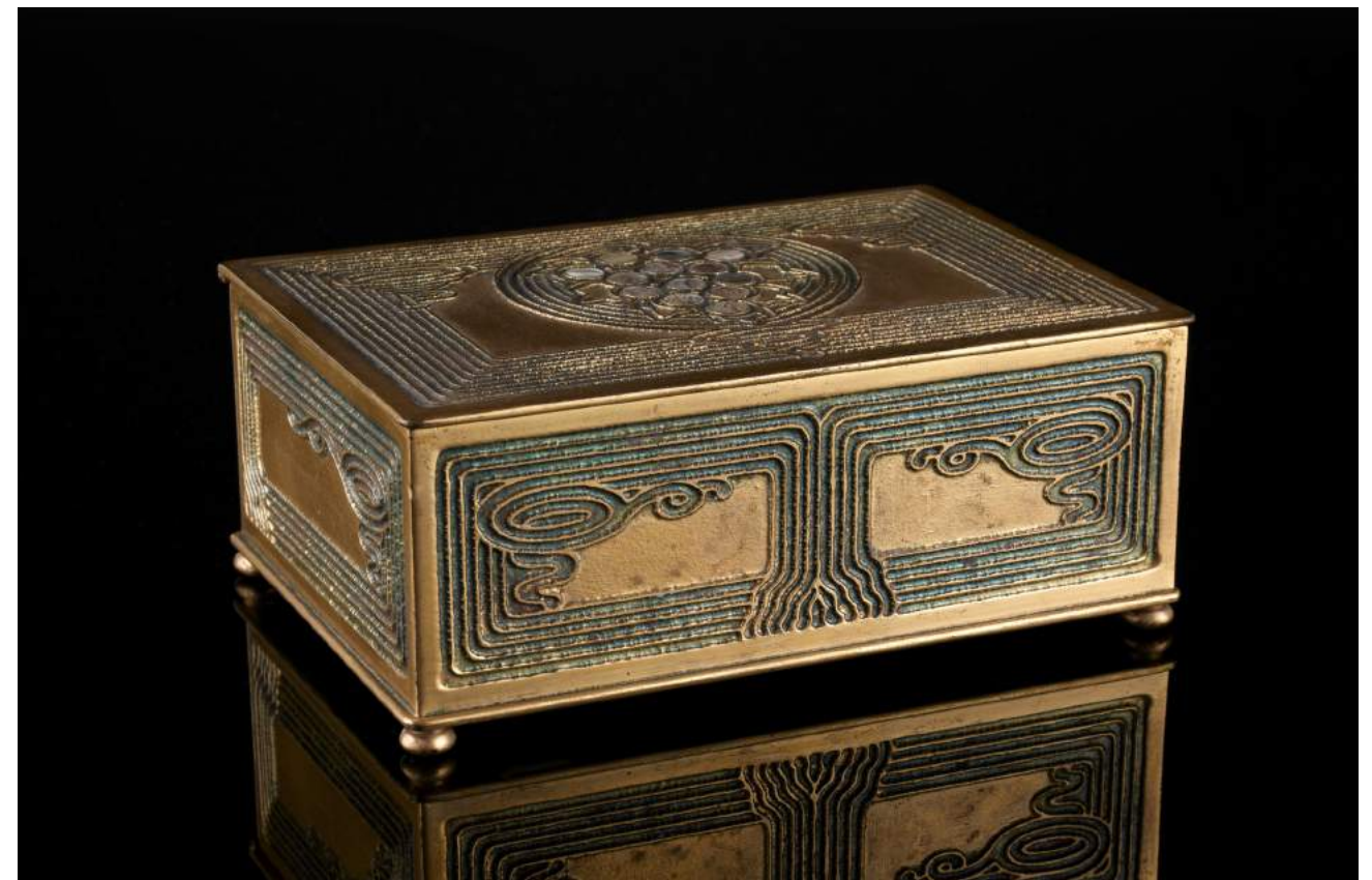
Tiffany Studios, Jewelry box, c. 1900-1910

Despite the enormous success he experienced in his many interrelated businesses over his long career, Tiffany's work went out of vogue with the advent of modernism and Louis C. Tiffany Furnaces, ceased operating in 1924. Tiffany Studios filed for bankruptcy in 1932. Tiffany's work received renewed appreciation in the mid-twentieth century, and continues to be associated with unparalleled quality and beauty to this day. When Tiffany died in 1933, the New York Times obituary counted him "among the best known of American artists."