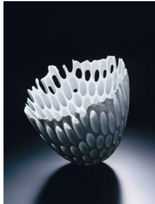
Yasuko Sakurai, White Flower , 2000, Private Collection, Porcelain

S oaring Voices reflects the rich and innovative ceramic culture of Japan through the presentation of 86 exceptional ceramics by 25 contemporary artists. The artists selected are all women—demonstrating the transition in Japanese society toward individual women artists becoming recognized in this creative realm traditionally held by men.