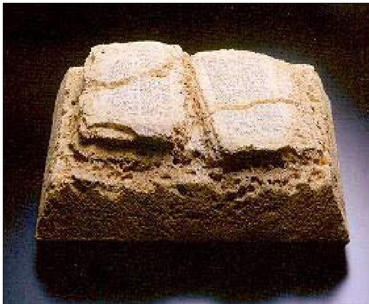
Takako Araki, Bible of the White Sand , 1989, Private Collection, Chamotte and sand