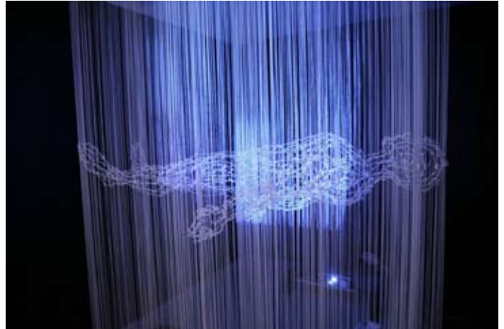
Duvier del Dago, ADN , 2008, Cotton and polyester thread, resin, wood, and metal

Polaridad Complementaria illustrates the features that have defined Cuban art in recent years, and pays particular attention to the works that illustrate the creators' capacity to connect the local reality to global concerns and universal human issues. This exhibition also aims to create a dialogue by examining and comparing the political, historical and common cultural links with the United States, while keeping in mind the lens in which the work will be viewed.