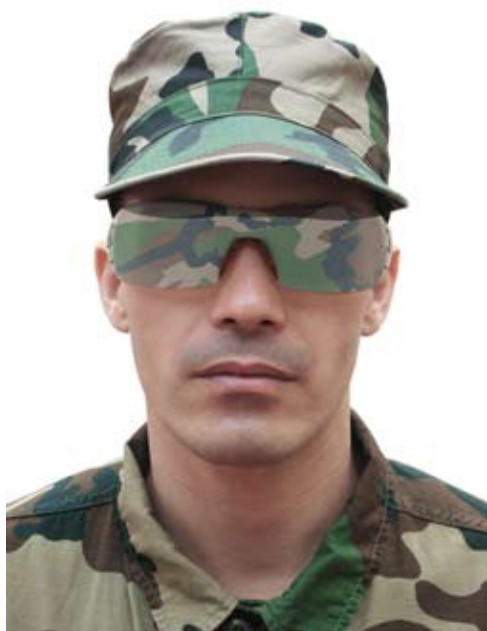
Adonis Flores, Tamiz , 2005, digital print