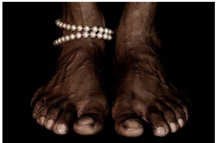
René Peña, From the series Untitled Album , 2007, Digital print