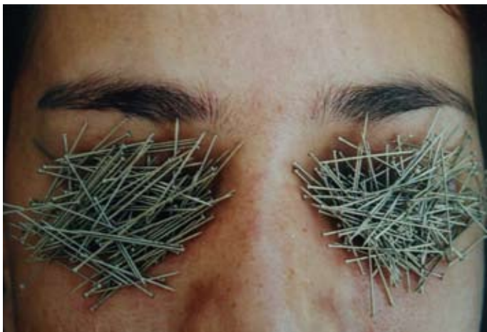
Abel Barroso, La ciudad en su laberinto/The City in its Labyrinth , 2007, Three-dimensional xylographies