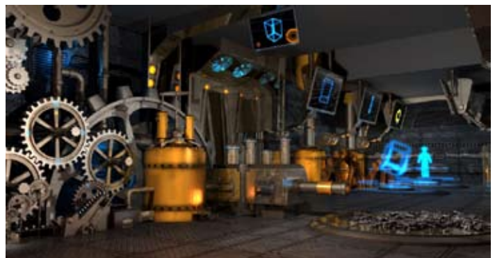
Douglas Pérez, From the series Pictopias , 2008, Oil on canvas