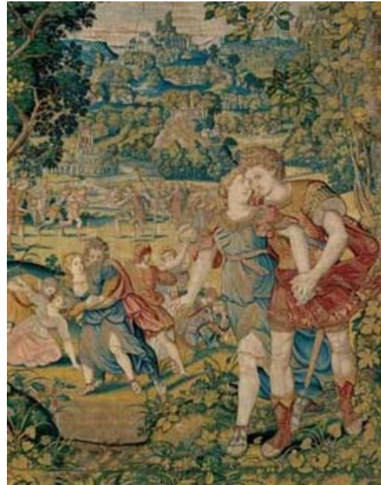
Detail: "The Rape of the Sabines" Workshop of Frans Geubels, c.1560 Kunsthistorisches Museum, Vienna

In the late Middle ages, Renaissance and Baroque, tapestry was the art form – far more costly and elite than art in any other medium (sculpture and painting included). Renaissance tapestries served a number of different purposes. They were symbols of rank, wealth and power and effective sources of propaganda, made to order for the religious and political elite. They could cost as much as a warship and be more expensive than great paintings by acknowledged masters. Michelangelo was paid less money for painting the ceiling of the Sistine Chapel than the designers of a series of tapestries commissioned by Pope Leo X (Acts of the Apostles) were. Tapestries were taken along on campaigns and hung outdoors during festivals, as a way of uniting townspeople around their lord. Tapestries were not only beautiful works of art, and sometimes objects of propaganda (The Holy Roman Emperor Charles V was even accompanied into battle by his court painter who made sketches at the site for later weaving), but they served a useful purpose as well, being transported from castle to castle, palace to palace, and placed on cold masonry walls for warmth as a form of insulation. They were colorful and lively backdrops in dark, dank, cold and windowless interiors. The most famous weavers were in France and Brussels – where these tapestries were woven.